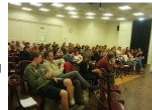
Attendees at the Swiss Affiliate function