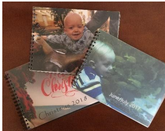
Figure 10 – Photo books

The digital age has made it relatively easy to produce photo memory books. I have compiled many over the years and airmailed them to my grandchildren as a visual