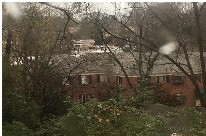
Figure 19 – Airbnb outlook

Airbnb has become a lifeline for distance grandparents and was mentioned by my participants, and I am a regular user myself. This platform offers ordinarily, hard to find accommodation in non-touristic suburbs and neighbourhoods. On my last visit to Atlanta, I managed to reserve an Airbnb which was literally over the back fence from Daughter No 2's apartment. Our grandsons could visit, and it became a second home. We were neighbours, and this made for an incredibly convenient winter's stay, additionally avoiding the expense of an Uber to and fro.