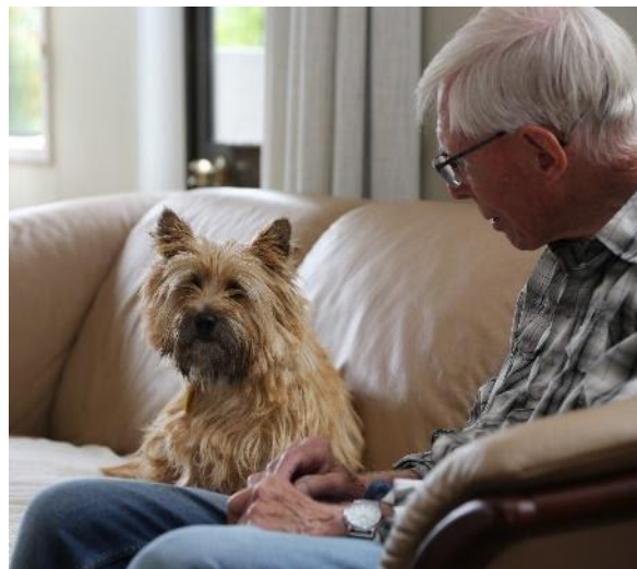
Figure 15 – Breezee