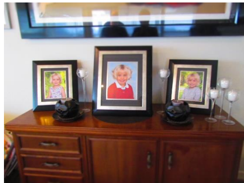
Figures 7, 8, & 9 – Framed photos and Frozen them décor