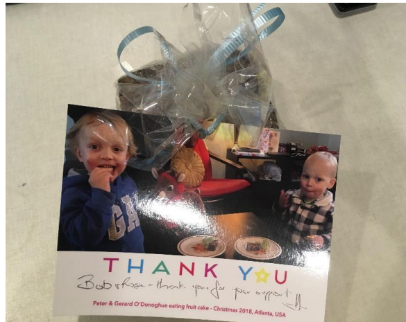
Figure 3 – Participant fruitcake gift and thank you card

All interviewees raised questions about my own family and their current situations as most participants knew my children and these questions were not unexpected. I answered the questions even though I wanted my participants' experiences to be the topic of discussion. Sometimes this dialogue allowed me to speak on an aspect of distance grandparenting and redirect the conversation back to the interviewees. During my home visits I observed, and on some visits, with their permission, photographed how they 'displayed' their distance family in their home, and I will discuss this in more detail in my findings.