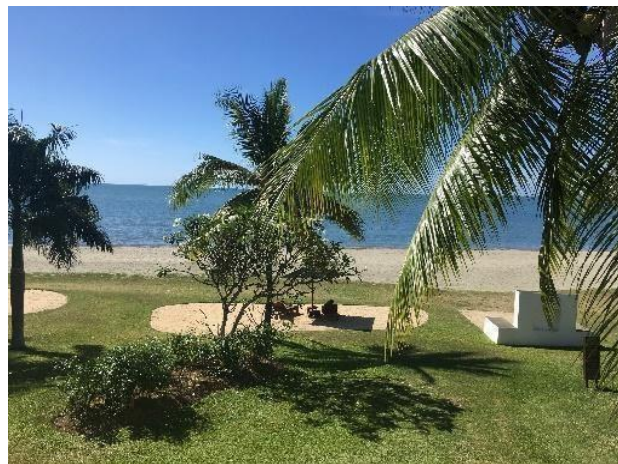
Figure 17 – Fiji hotel resort

Fiji is dotted with tiny isolated islands. We were at a resort surrounded by hundreds of guests and staff. My husband and I might as well have been stranded on a desert island. There was nothing we could do on the other side of the world. Later that day, across the coconut tree, palm-filled expanse of Pacific Ocean fringed lawn, a Fijian band was singing for the seafood buffet extravaganza. We 'ate in'. The next day I