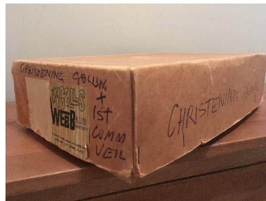
Figures 11 & 12 – Christening Gown and box

As mentioned in Chapter 3, I gave fruit cake to my grandparent participants as it may have caused them to reflect on taste senses-filled experiences. There was also my own family history behind this gesture. My late Mother-in-law was famous for her fruit cakes. When she died I acquired her prized, sturdy, 'old-school' cake tin. Although I have little interest in baking, I am now known for my fruitcake. I have gingerly attempted to pass on a love of fruitcake to my American grandsons who live in a country that has little appreciation of this rather English treat. It is no exaggeration to