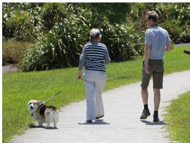
Figure 14 – Willow

For many people, a dog is an important family member. Twice I have stayed with Grandparents No 3 and it was during these visits I was introduced to Willow, their corgi. She was an important part of Grandparents No 3's daily routine and the devotion from them, and the dog in return, was evident. My husband and I, despite our ambivalence towards pets, took a liking to Willow. The grandparents explained to me what Willow really meant to their in-country and distance grandchildren.