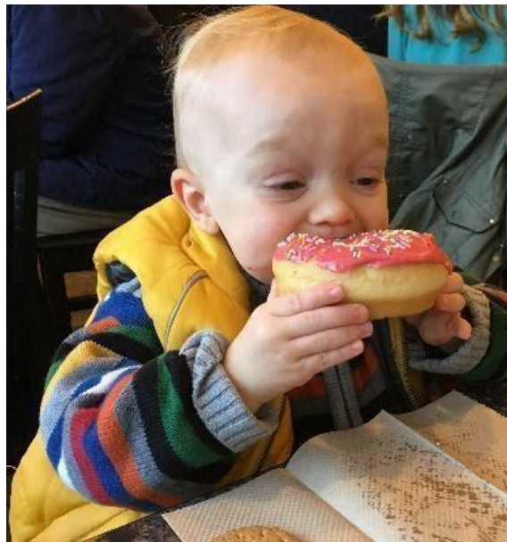
Figure 16 – Doughnut eating

A lack of familiarity around current rules, childcare routines and discipline can be a challenge. What worked on one visit with the grandchildren may not be the default routine on the next. Child-rearing involves constant review and grandparents are understandably, not necessarily, updated on all changes. Doughnuts are a regular, purchasable, fundraising treat after some American church services. On one visit, doughnuts were a definite "no, no" from my health-conscious daughter, and her toddler was distracted away from all such sugar-laden delicacies. I dutifully followed this regime on the next visit, explaining a doughnut was not a possibility, however, World War III erupted. Little did I know that between visits the rules had changed, and doughnuts were now a regular feature of post-church attendance. It seemed to take the rest of the day for our world to regain a sense of calm.