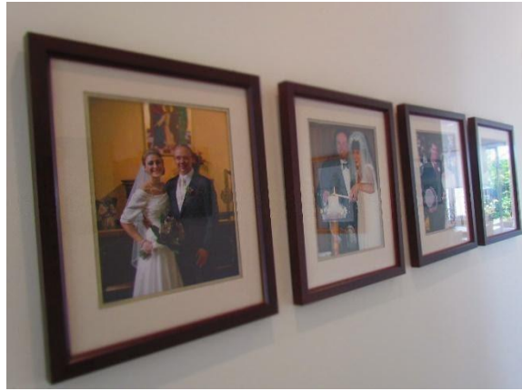
Figure 18 – Family photos on the wall

As I write this thesis, the latest distance family separation journey is still in its infancy. When I walk up and down the hallway at my home, I am constantly reminded that I need to somehow, sometime, replace another wedding photo in the family gallery. Our 'things' have been messed with again.