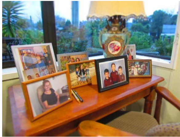
Figure 6 – Family photos on desk

I wondered if sometimes a lack of displayed photos is due to the digital age. In years gone past, when a film canister was full it was automatically taken to the chemist and expensive prints secured. When our first grandchildren were born a grandparent owned a 'brag book'; a small photo album featuring a selection of baby photos to show off. These days photos are saved on phones and iPads and perhaps photos around the home are more incidental. I never asked my participants if a grandchild featured in their mobile phone wallpaper, but it would have been an interesting question: mine do. Have our phones replaced the mantelpiece?