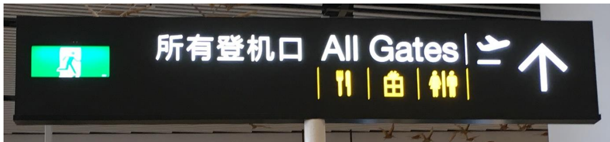
Figure 5 – All Gates airport sign