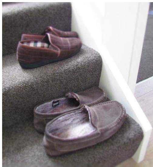
Figure 13 – Slippers on stairs

While writing this chapter No 1 son visited. My husband and I have a habit of leaving our slippers at the bottom of the stairs when we go out, in readiness for our return. One day the men left for an outing and I was home alone and I noticed two pairs of male slippers on the stairs. This little ritual became a comforting sight of a relaxed family visit. I now wonder when the visiting slippers will next appear